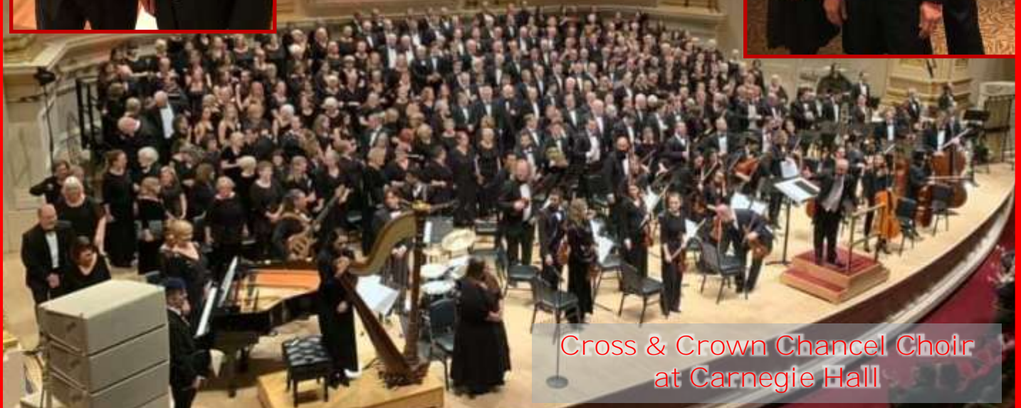
Cross & Crown Chancel Choir at Carnegie Hall